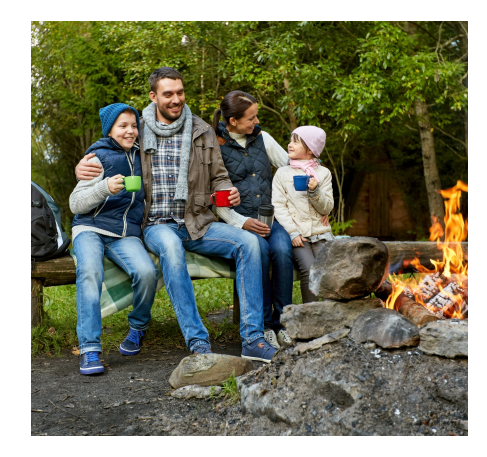
Savers who participated in America Saves Week want to be better prepared for financial emergencies.